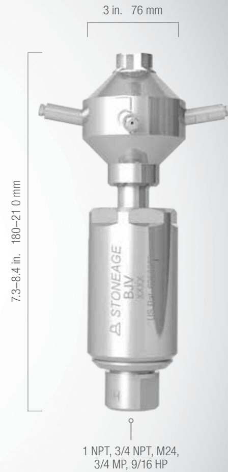
1 NPT, 3/4 NPT, M24, 3/4 MP, 9/16 HP