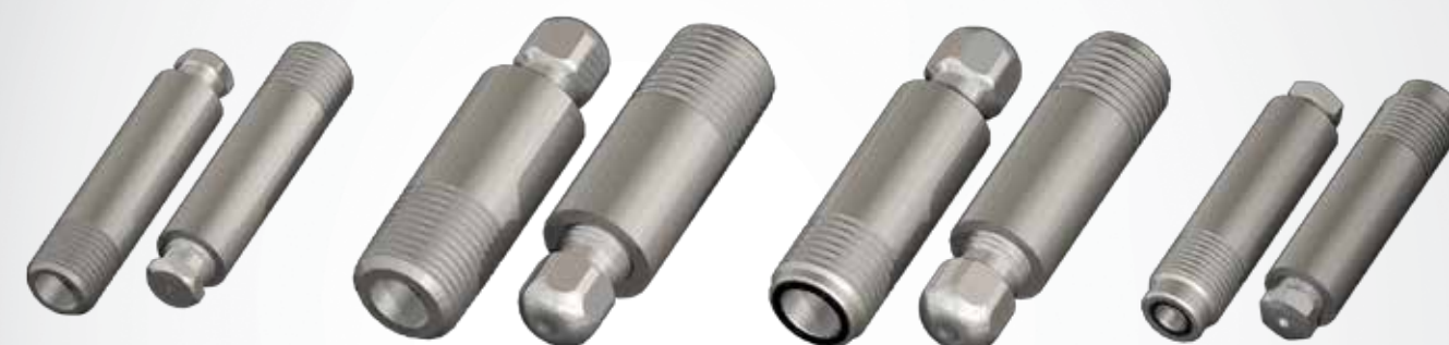
SA 567-P4P2 Fits 1/4 npt ports