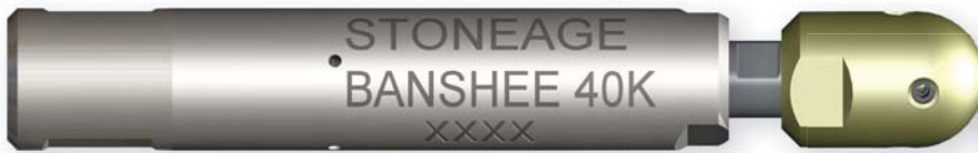
Tool shown to exact size.

The BN18-40k-L6™ removes the toughest polymers and plastics.