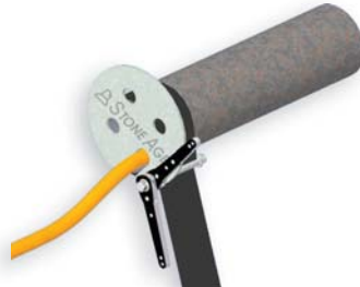
BJ 310 for 4" - 8" Pipes

User is responsible for securing to pipe. Handles hose O.D.'s from 3/8" to 9/16".