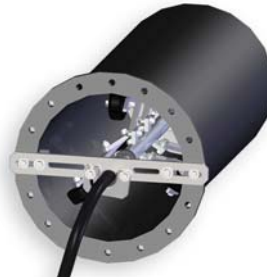
BJ 320 for 5" - 17" Pipes

Includes clamp for securing to pipe. Handles tool O.D.'s of 1-1/2" diameters or larger.