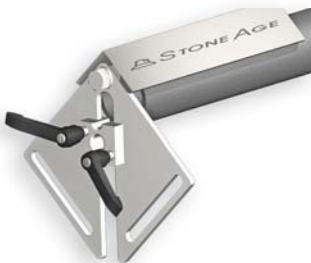
BJ 305 for 2" - 6" Pipes

These devices are designed specifically to increase operator safety. They help prevent the nozzle from backing out of the pipe. Several options are available including jigs for small diameter pipes, for pipes with various flange bolt circle diameters, and adaptors for pipes with no flange entry.