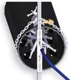
BJ 325 Extensions for 15" - 36" Pipes

Handles hose O.D.'s from 9/16" to 1-7/16".