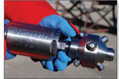
BJV-20k™ with BJ 144-P4-6 head.

The BJV-M™ is a 2-D self-rotating nozzle with a maximum working pressure of 15k psi. The BJV-M™ handles pipes and drains from 6"-72" at 15k psi, as well as tanks, reactors, process vessels, heat exchanger shells and coker cyclones. The BJV's™ use viscous fluid rotation speed control and operate using 2, 4 or 6 jets in balance. The BJV-M™ can handle flows up to 100 gpm and the BJV-P16™ can handle up to 200 gpm.