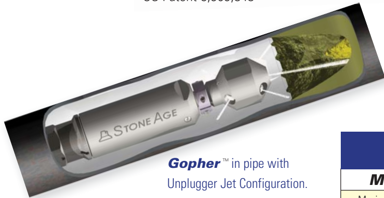
Gopher™ in pipe with Unplugging Jet Configuration.