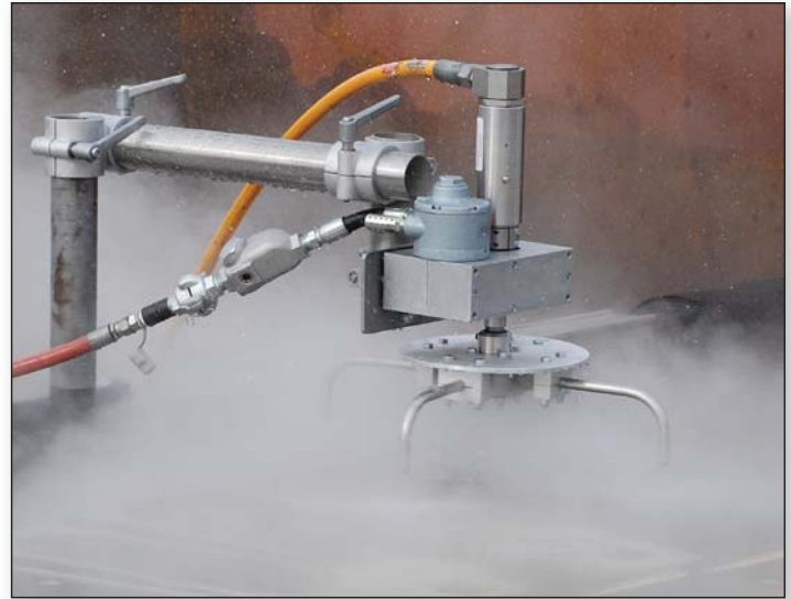
40k psi with 4-arm assembly.

40k psi Air-powered & Hydraulic Surface Cleaners