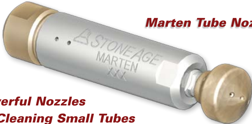
Marten Tube Nozzle

The Marten is a powerful nozzle used in a wide range of applications.