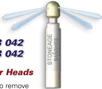
BN13 042 BN18 042

All BANSHEES are available with either pipe thread connections, left hand & right hand Medium Pressure threads, and BSPP as noted in the chart.