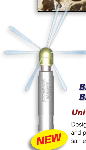
BN18 044 BN24 044