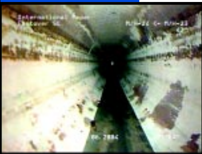
Before and after photos illustrate how a centralizer allows all-around cleaning.