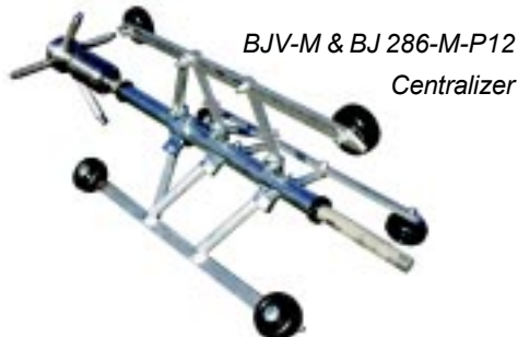
BJV-M & BJ 286-M-P12 Centralizer