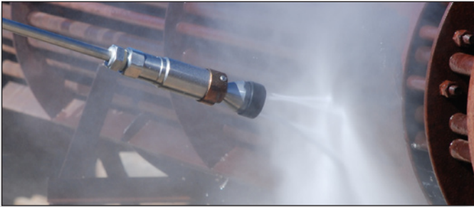
Jet reaction force can be very powerful