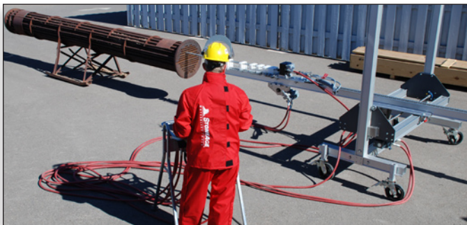
Tube Cleaning Systems