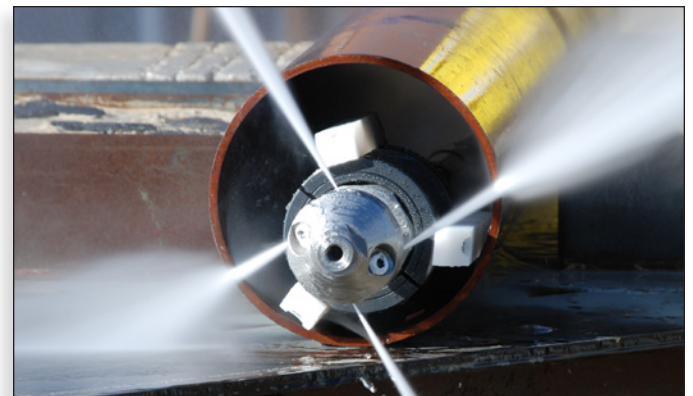
40k psi Pressure (2800 bar)