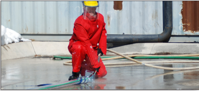
BJ 305™ backout preventer in use