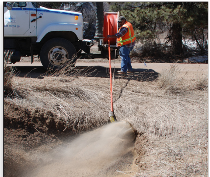
Protective sleeve in use