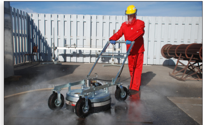
Floor & Deck Cleaners